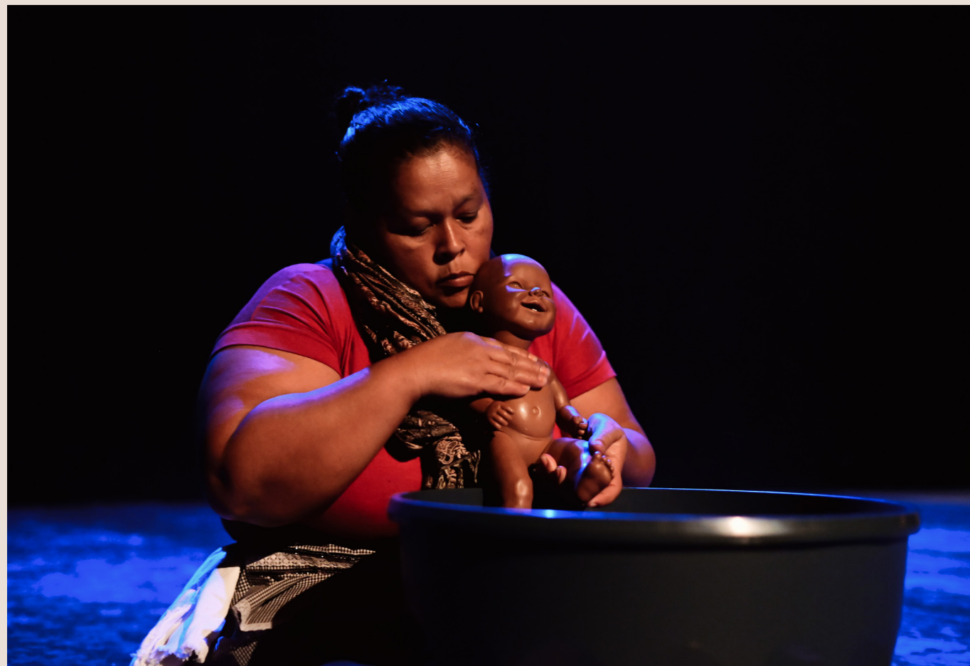
La Cachada Teatro