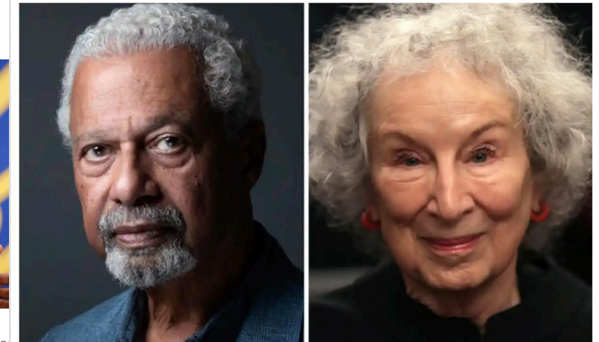
Abdulrazak Gurnah and Margaret Atwood.

Lviv BookForum is partnering with Hay festival for a programme of in-person and online events, which will be streamed free from 6-9 October