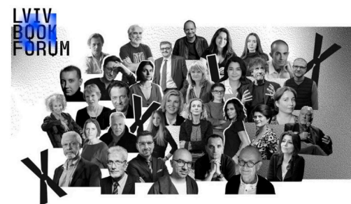
Lviv Bookforum en Ucrania.

La vigésimo novena edición del Lviv BookForum , el mayor festival literario de Ucrania, se realizó de manera híbrida (virtual y presencial), en este mes de octubre, con alrededor de 40 invitados que discutieron sobre temas como el arte en tiempos de guerra, la memoria, la igualdad de género, la pérdida, la corrupción, el imperialismo y la esperanza.