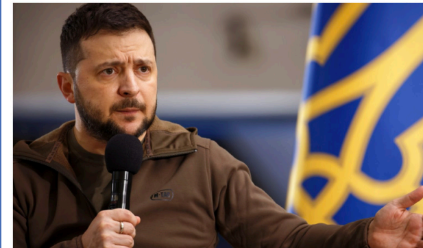
Volodymyr Zelensky

Ukraine's largest literary festival, Lviv BookForum, has opened with messages of support from President Volodymyr Zelensky, supported by authors appearing at the event including Margaret Atwood and Neil Gaiman.