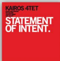
KAIROS 4TET Statement of Intent