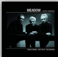
MEADOW Blissful Ignorance