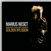
MARIUS NESET Golden Xplosion