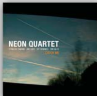
NEON QUARTET Catch Me